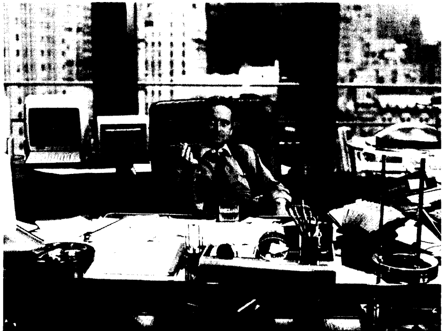
"Greed, for lack of a better word, is good," the fictional villain Gordon Gekko famously declared in Wall Street (1987). It's said that the film's depiction of brutal competition drew even more recruits to the real Wall Street.

So what's wrong with this? Plenty. Competition skews the balance, and threatens real democracy. More fundamentally, it fails to comprehend freedom's true character. In the human balance, given that we are creatures of nature and artifice, of both rivalry and love, we normally live in parallel, mutually intersecting worlds of competition and cooperation, if not quite as grimly or definitively as Ruskin imagined. Competition may not be the law of death, but as the law of the marketplace and the radically individualistic people who populate it, it distorts and unhinges our common lives and slights the necessary role of cooperation and community in securing liberty. In construing ourselves exclusively as economic beings—what the old philosophers used to call homo economicus —we account for ourselves as producers and consumers but not as neighbors and citizens. We shortchange real liberty.